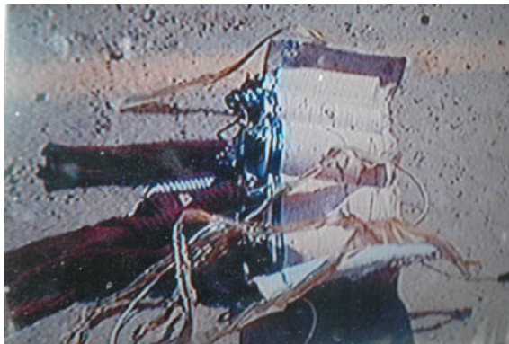
The explosive belt seized on the teenager’s body at the Beqaot roadblock