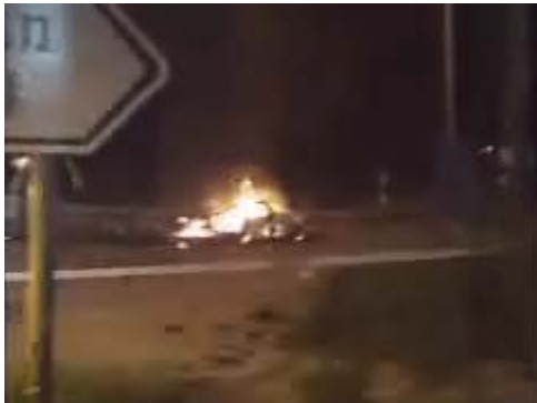
The car in which the suicide bomber blew himself up going up in flames