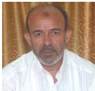
Palestinian Information Minister Youssef Rezqa: granting legitimacy to suicide bombing terrorism

■ Youssef Rezqa , the Information Minister of Hamas' government, in addition to other spokesmen on behalf of Hamas, repeatedly justified the terrorist attack in Kedumim as well as terrorist attacks in general. They claimed that the “Israeli occupation” was to blame for the terrorist attacks and that it was the Palestinians' “right” to continue the “resistance”. The Information Minister claimed that the government's opinion and Abu Mazen's stance regarding the terrorist attack were not contradictory to each other (Al-Bayan, citing an interview granted by Youssef Rezqa to AFP, April 1).