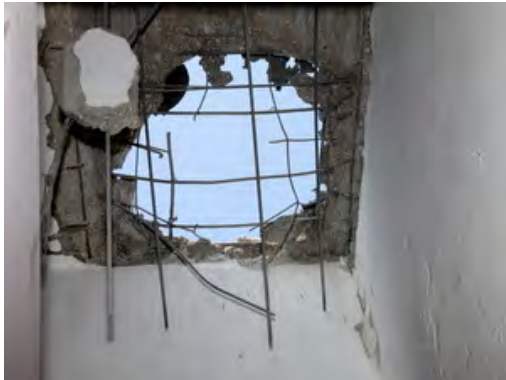
Site of the Grad rocket hit: a school in Beersheba (August 21)

Claiming responsibility: The Al-Nasser Salah al-Din Brigades, the military wing of the PRC, fired two Grad missiles at Beersheba at 1940 hours on August 20, 2011, and "the enemy admitted people were killed." According to the announcement, the rocket fire was in retaliation for the deaths of prominent figures in the organization and the PRC would continue jihad and "resistance" as the only way to liberate "Palestine" (Qaweim.com website).