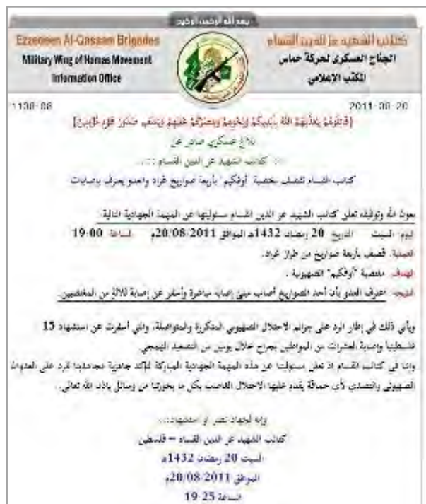
The Izz al-Din al-Qassam Brigades announcement regarding the rocket attack on Ofakim (removed shortly thereafter).

■ In our assessment Hamas has not directly participated in the current round of escalation but it is reasonable to assume that it gave practical support to the organizations operating under its aegis. Hamas does not claim responsibility for attacks and in one exceptional instance, retracted an announcement it made about firing rockets at Ofakim. That occurred on August 20 at 1925 hours in the evening (2025 hours Israeli time), when the Izz al-Din al-Qassam Brigades posted an announcement on their website claiming responsibility for firing four Grad rockets at Ofakim. At 2140 hours the announcement was removed and eight minutes later the PRC's Salah al-Din Brigades claimed responsibility for the attack (Note: For the record, three rockets fell in Ofakim and three local residents sustained minor injuries.)