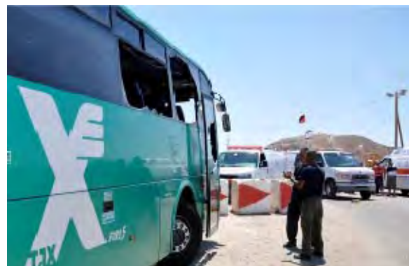
Left: The terrorists' car (Photo: Ariel Hermoni for the Israeli Ministry of Defense, August 18, 2011). Right: The bus shot at by the terrorists. About 20 passengers were wounded (Photo: Lior Grundman, August 18, 2011).