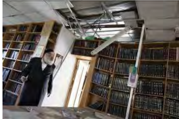
A rocket hits a synagogue in Ashdod (Photo: Amir Cohen for Reuters,, August 19, 2011).