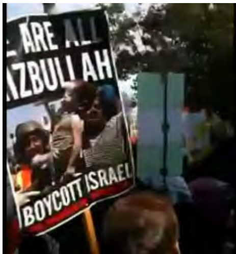
Signs calling for a boycott of Israel held by Inminds activists, a organization promoting the BDS campaign against Israel