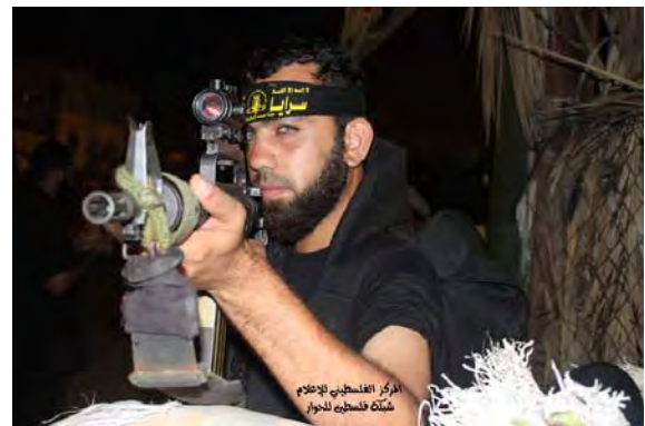
Muataz Qraike, PIJ terrorist operative, killed in an IDF attack ( PALDF, August 20, 2011).