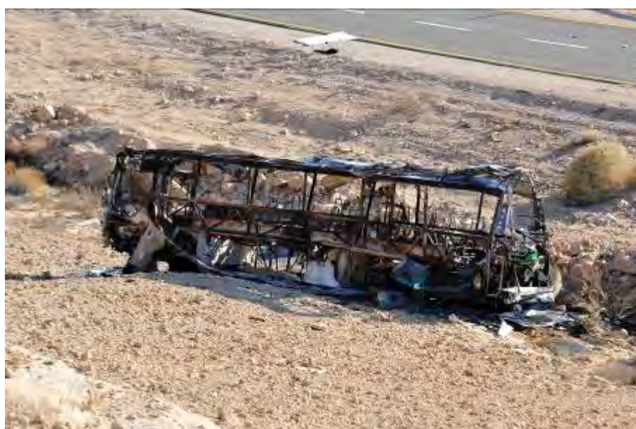
One of the buses attacked north of Eilat on August 18. The terrorists drove close to the bus and detonated an IED or an explosive vest. The blast killed the driver and the bus, which was empty, was completely burned (Photo: Ariel Hermoni for the Israeli Ministry of Defense, August 18, 2011).