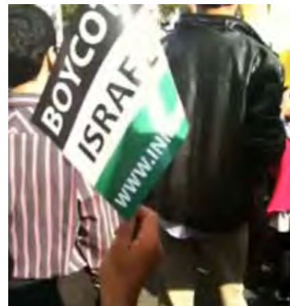
One of the signs held at the rally in Trafalgar Square.