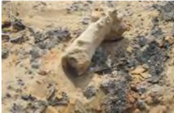
Phosphorus-containing mortar shell which fell in Israeli territory

■ In addition to rocket fire, dozens of mortar shell hits were identified in Israeli territory. At least one of them contained phosphorus. It was not the first time the Palestinians used phosphorus-containing mortar shells. They are mostly used by the Army of Islam, affiliated with the global jihad. 5