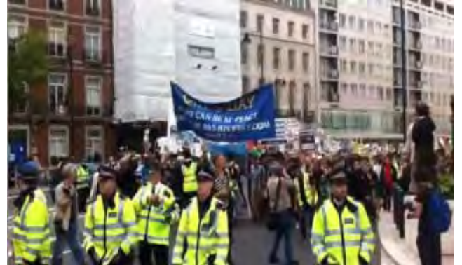
The rally in London