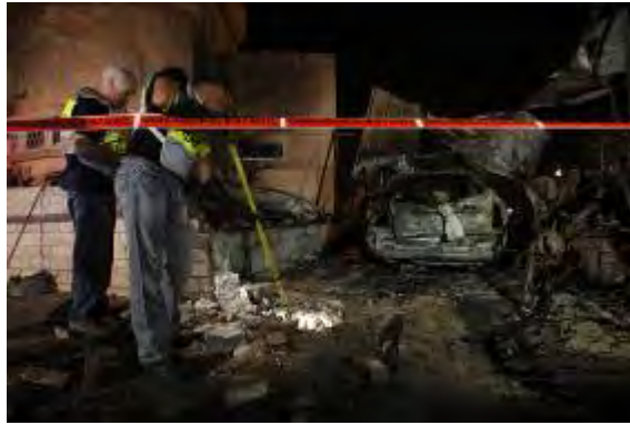
Site of the Grad rocket hit in Beersheba which killed an Israeli civilian and wounded sever (Photo: Boaz Ratner for Reuters, August 20, 2011).

■ In our assessment Hamas has not directly participated in the current round of escalation but it is reasonable to assume that it gave practical support to the organizations operating under its aegis. Hamas does not claim responsibility for attacks and in one exceptional instance, retracted an announcement it made about firing rockets at Ofakim. That occurred on August 20 at 1925 hours in the evening (2025 hours Israeli time), when the Izz al-Din al-Qassam Brigades posted an announcement on their website claiming responsibility for firing four Grad rockets at Ofakim. At 2140 hours the announcement was removed and eight minutes later the PRC's Salah al-Din Brigades claimed responsibility for the attack (Note: For the record, three rockets fell in Ofakim and three local residents sustained minor injuries.)