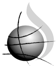
INTERNATIONAL COMMISSION OF JURISTS