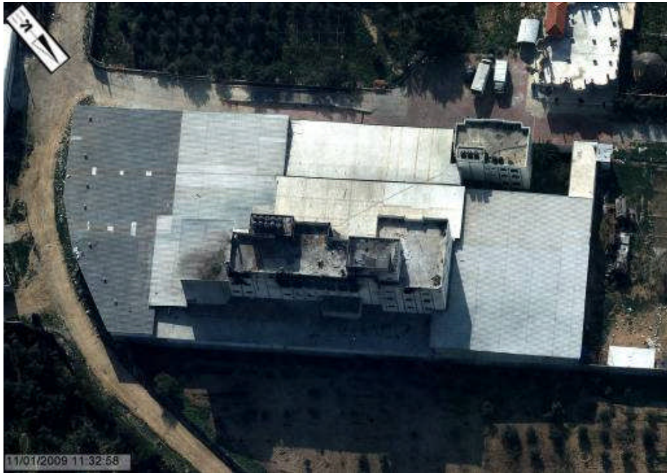
► El-Bader flour mill, 11 January 2009, following alleged incident