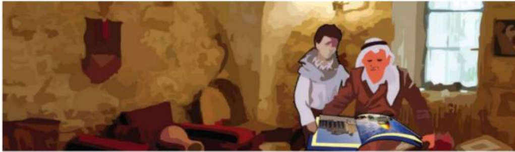
Illustration from Palestinian textbook, p. 69:

Dear student, think deeply about the picture on Activity 4A on p. 69, and then answer the following questions: