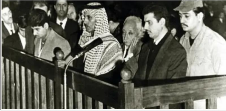
Show trial in January 1969