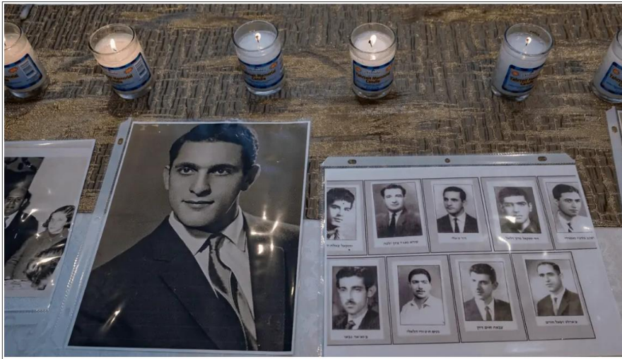
Memorial candles were lit for the nine victims of the Baghdad hangings during a ceremony at Bene Naharayim synagogue, New York on 3 February 2019

media Elaph and Akhbar , and posted the articles in English translation on Facebook. Here is an abridged version, combining Parts 1 and 11 .