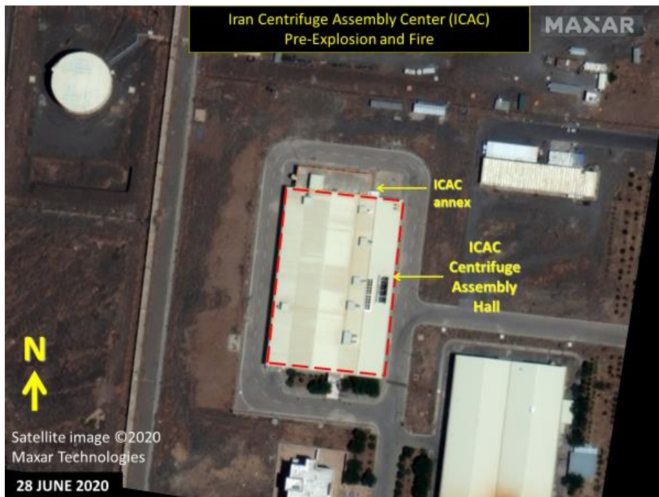
Figure 1. High resolution satellite image of the Iran Centrifuge Assembly Center prior to the explosion, dated June 28, 2020, released by Maxar, via Christiaan Triebert of the New York Times on Twitter, July 8, 2020. Satellite image ©2020 Maxar Technologies.