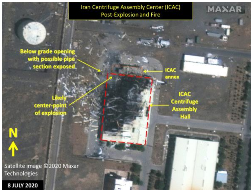
Figure 2. July 8, 2020 post-explosion high resolution satellite image of the ICAC, annotated by the Institute, image released by Maxar, via Christiaan Triebert of the New York Times on Twitter, July 8, 2020. Satellite image ©2020 Maxar Technologies.