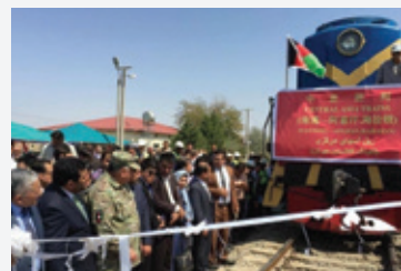
In the Heart of Asia

Since 2001, Afghanistan has moved towards the progressive realization of human rights values and principles; as such, Afghanistan would be an experienced partner and valuable asset in furthering and improving the work of the Human Rights Council.