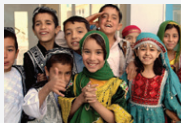
Promotion of Diversity