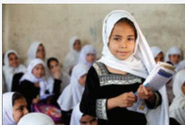
15 Years of Achievements

Afghanistan has accomplished many practical achievements in the field of human rights, particularly since the fall of the Taliban regime in late 2001. Yet, there are many challenges ahead that can be overcome through collective efforts and effective international cooperation. The Afghan Constitution, in its preamble, states the importance of the UN Charter and the Universal Declaration of Human Rights, while specific articles ensure the rights of every individual. Under Article 58, the Afghanistan Independent Human Rights Commission (AIHRC) has been established to monitor human rights matters in the country.